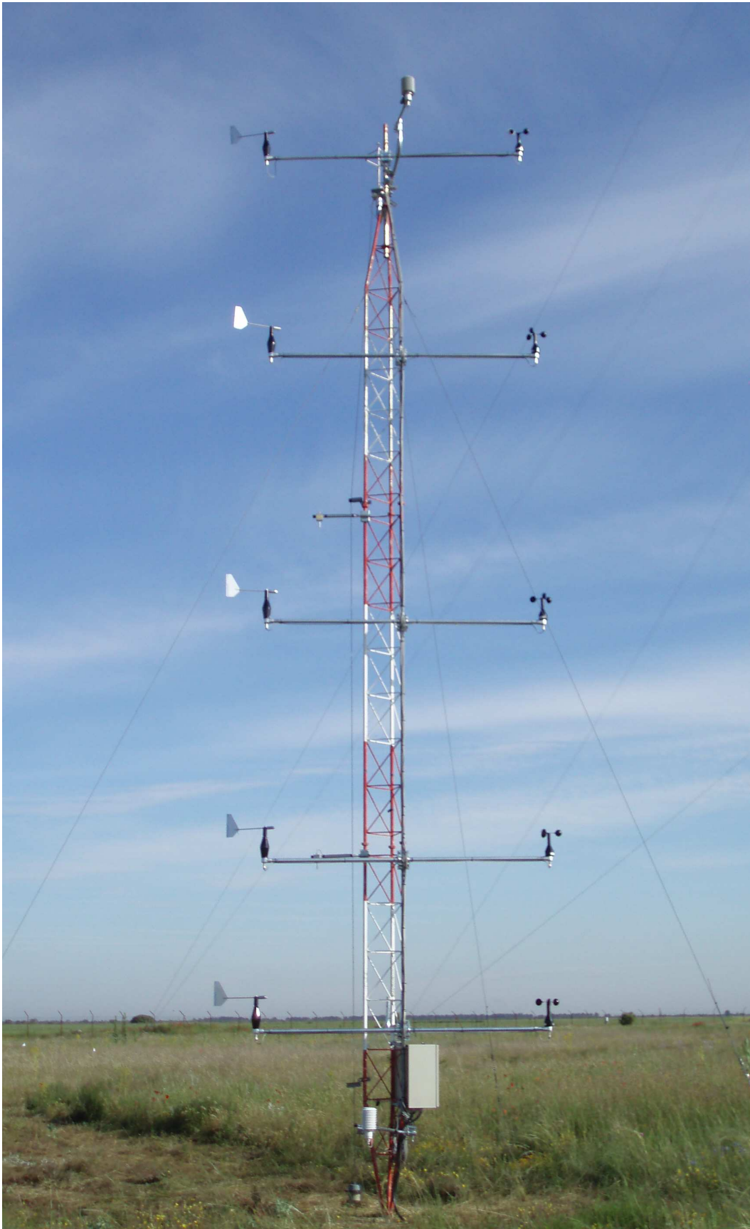
Figure 1: Picture of the 10m mast located at the CIBA site, with instrumentation at different levels.